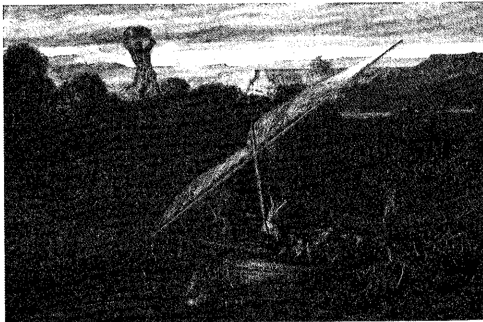
Polyphemus Attacking Sailors in Their Boat , 1855. Alexandre-Gabriel Decamps. Oil on canvas, 98 x 145 cm. Musée des Beaux-Arts, Rouen, France.

Viewing the painting: How does this painting reinforce the sense of urgency conveyed by the description of Odysseus’s escape?