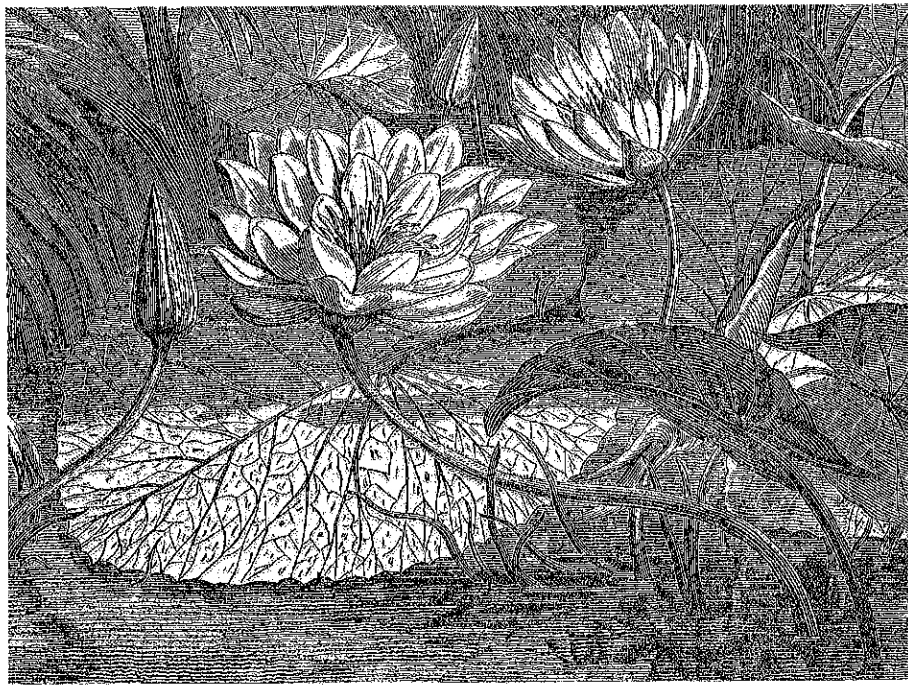
An Egyptian Lotus Plant, 1834. Unattributed woodcut. Private collection.

Viewing the art: What connection can you make between the appearance of the lotus plant and its effect on Odysseus's men?