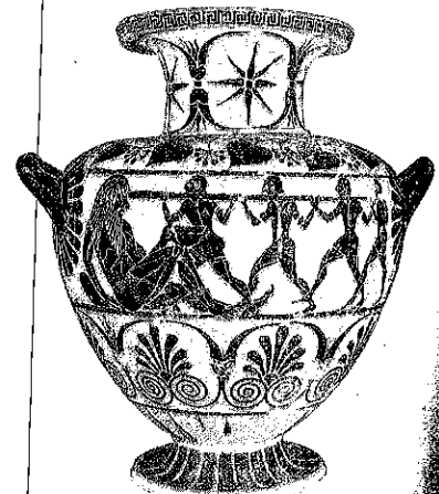
The Blinding of Polyphemus. Greek hydria. Museo Nazionale di Villa Giulia, Rome.

268 fuddle and flush: the confused mental state and reddish complexion caused by drinking alcohol.