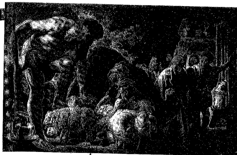
Odysseus. Jacob Jordaens (1593–1678). Oil on canvas, 61 x 97 cm. Pushkin Museum, Moscow.

Viewing the painting: Imagine that you are the man beneath the ram on the left. What is going through your mind? What might the Cyclops be thinking and feeling in this scene?