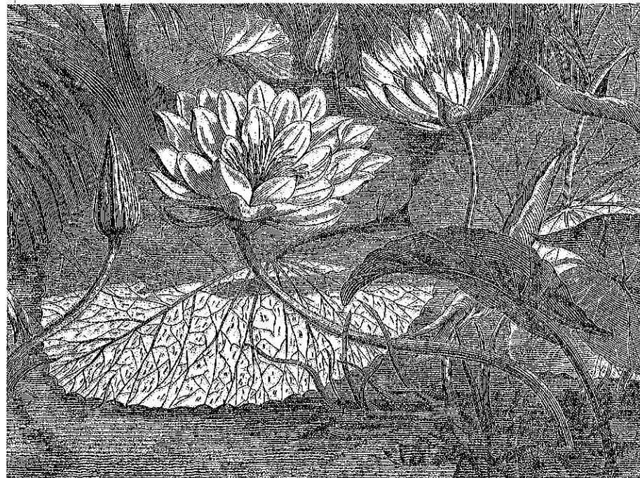
An Egyptian Lotus Plant, 1834. Unattributed woodcut. Private collection.

Viewing the art: What connection can you make between the appearance of the lotus plant and its effect on Odysseus's men?