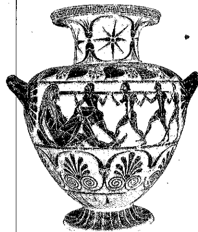
The Blinding of Polyphemus. Greek hydria. Museo Nazionale di Villa Giulia, Rome.

266 nectar and ambrosia: the foods of the gods, causing immortality. The Cyclops suggests that any wine is a gift from heaven, but this one is like the gods' own drink. 268 fuddle and flush: the confused mental state and reddish complexion caused by drinking alcohol.